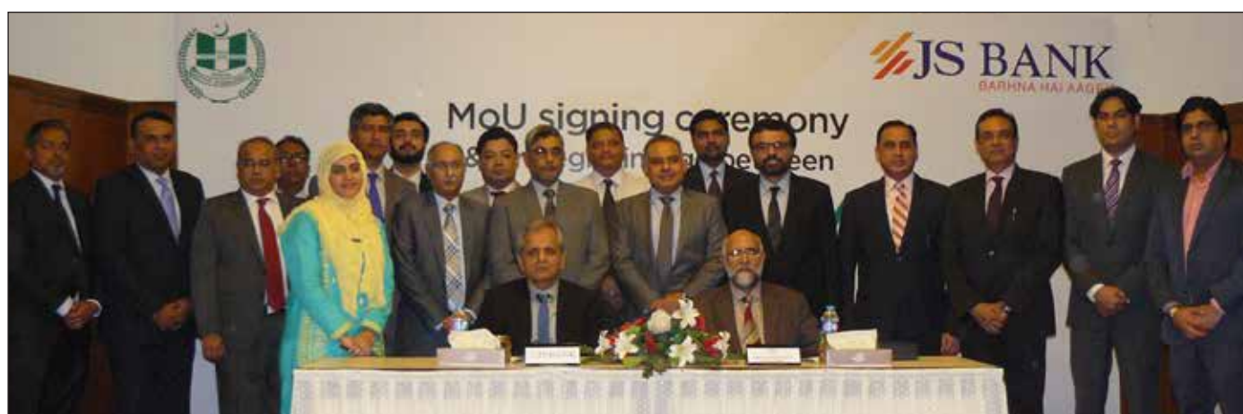
Senior members of JS Bank and Pakistan Institute of Management officials at the strategic linkage signing ceremony.

The learning and organization development division of JS Bank has initiated various projects to enhance its human asset in accordance with the best worldwide practices. The underlying goal is to empower every employee of the JS Bank family by providing them with opportunities to polish their professional and personal skills and contribute towards organizational goals.