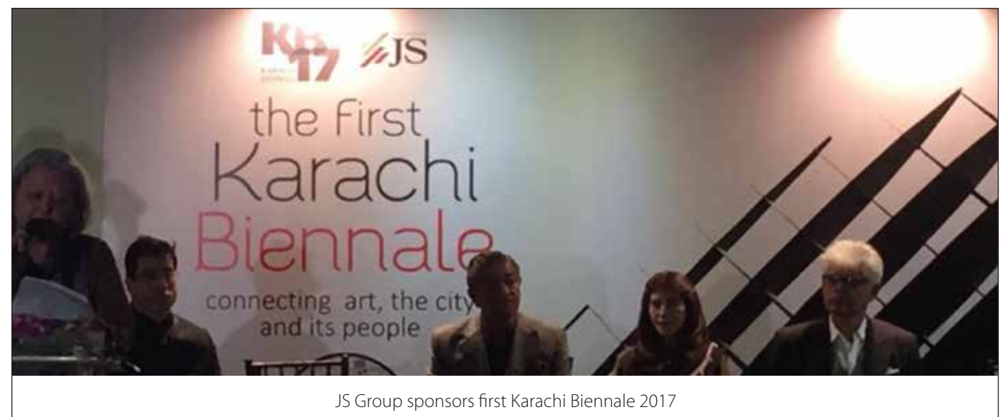
JS Group sponsors first Karachi Biennale 2017

JS Group sponsored Karachi Biennale, 2017. The group's primary objective to support KB is to promote Art from Pakistan, the region and the rest of the world in exhibitions to a wider audience. In this regard, JS Group has also undertaken extensive public outreach program. Regular projects are also planned to penetrate local communities and public spaces until October 2017. JS Group & KB plan to reach 20% of Karachi's population. Both partners are willing to support youth so their minds can be opened to a world of new possibilities as diverse activities have been planned to stimulate students and young professionals with exposure to innovation, new visual knowledge, hands-on training and cultural links through these projects.